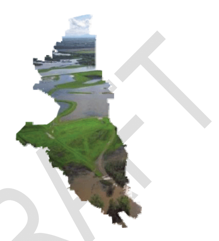
Delta Regional Monitoring Program Data Integration Strawman Proposal November 20, 2009